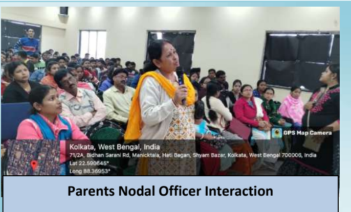
Parents Nodal Officer Interaction