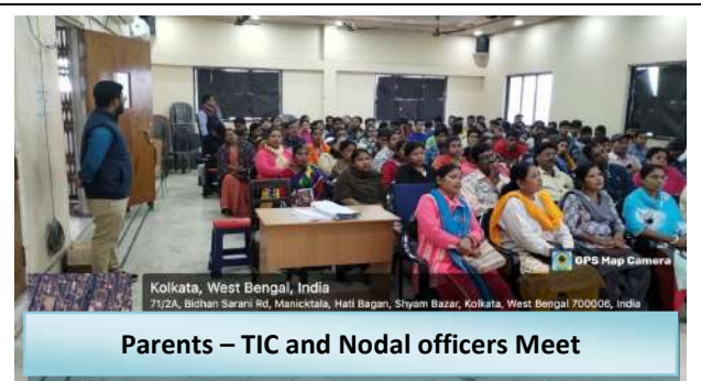
Parents – TIC and Nodal officers Meet