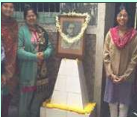
23rd January, 2015, Observing Netajis's Birth Anniversary