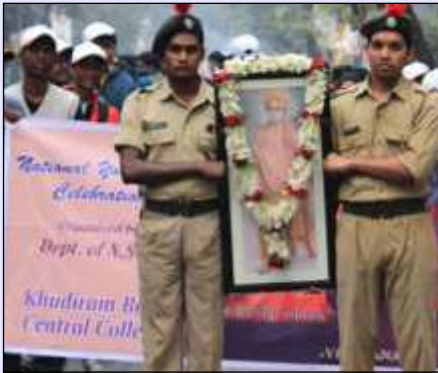
12th January, 2014 150th Birth Anniversary of Swami Vivekananda, National Youth Day