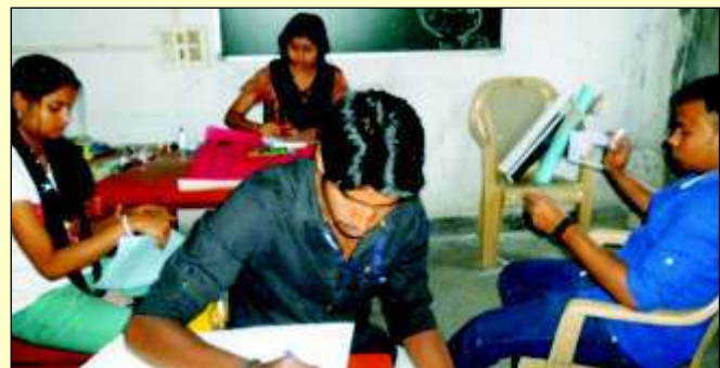
Students Workshop, History Deptt.