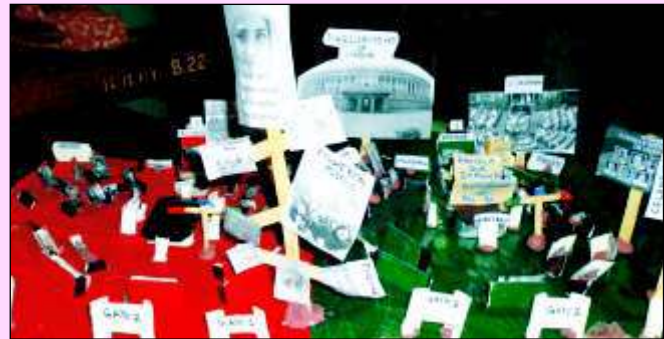
Women In Parliament Model , Pol. Sc. Deptt