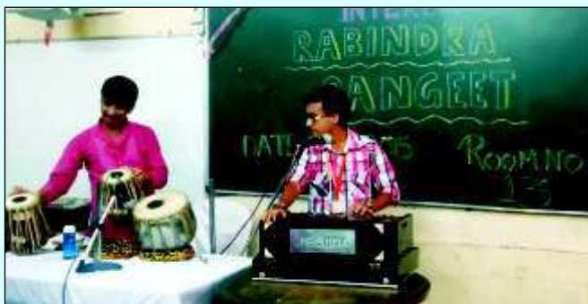
Student of Geography Deptt. Participated in Inter College Cultural Competition at Maaharaja Manindra Chandra College