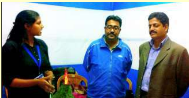
Inter College Science Exhibition At Vidyasagar College, Deptt. Of Geography Secured 3rd Prize