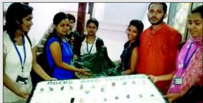
Participation in science exhibition, Maharaja Manindra Chandra College