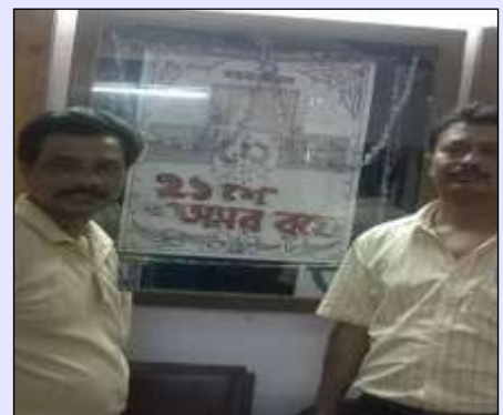
21st February, 2015 : Bhasa Divas Observed By Bengali Department