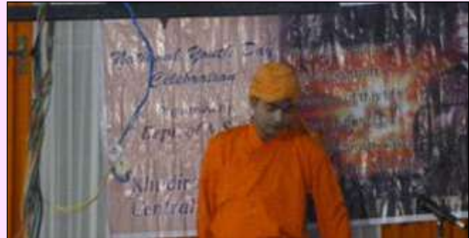
Drama on the life of Vivekananda was enacted by students on National Youth Day, 2015