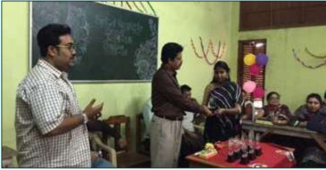
Farewell programme organized by Department of Geography