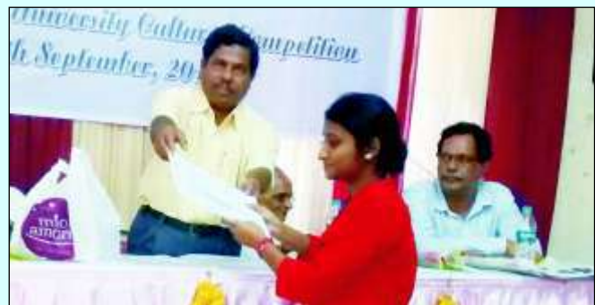
Student of bengali deptt. receiving prize in inter college cultural competition at maharaja manindra chandra college