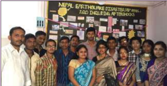
Departmental wall magazine of Geography Department