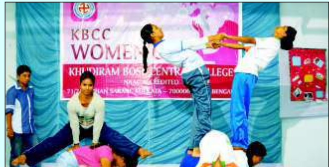
Yoga performance by students