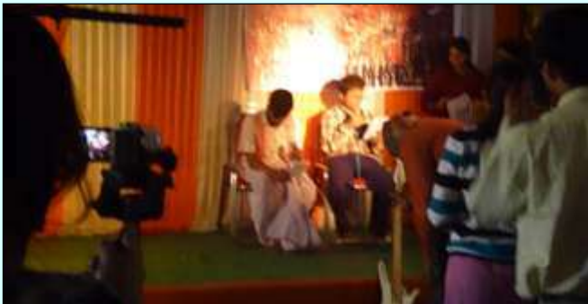
Shruti Natak performed by students on National Youth Day