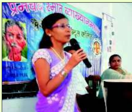
31st July, 2015, Munshi Premchand Divas Observed By Hindi Departement