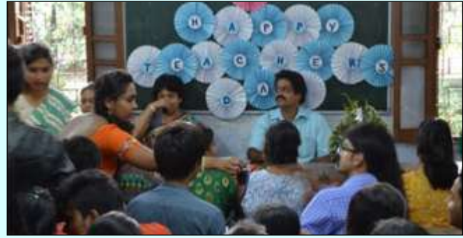
Teacher's Day organized by JMC Department