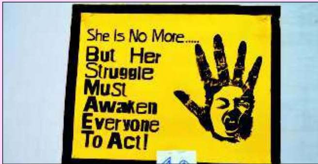
Poster Competition Within College, 1st Prize, Jmc Deptt.