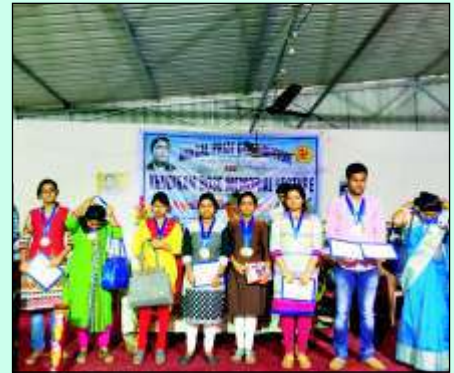
15th December, 2015 Annual Prize Distribution Day