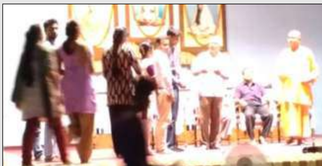
Inter college Quiz and Debate Competition organised by Belur Vidyamandir